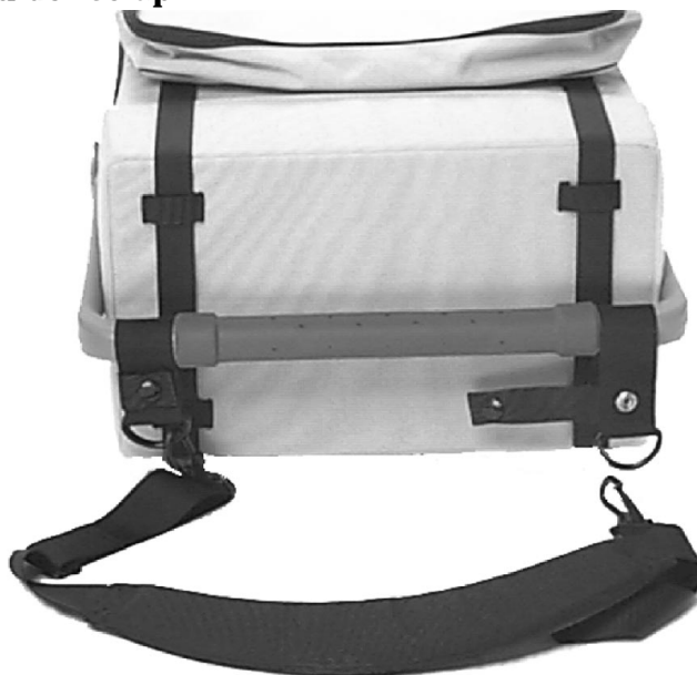
Figure 3 Shoulder Strap

WARNING To insure the safety of the shoulder strap, check for defects before each use.