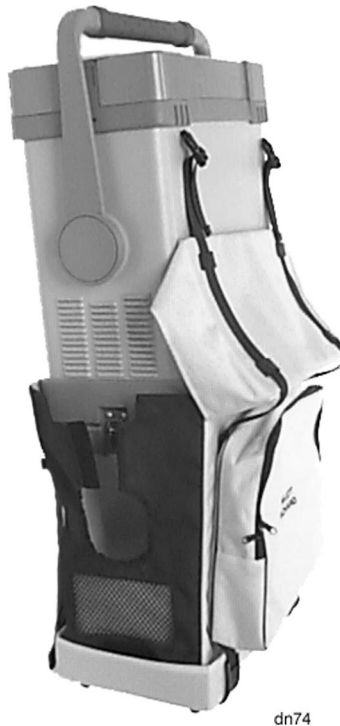
Figure 1 Side View of Carrying Case and Instrument

WARNING The operating and carrying case partially restricts airflow to the instrument causing the instrument to operate at a higher temperature. The maximum operating temperature with the case is 45 °C (the maximum temperature without the case is 55 °C).